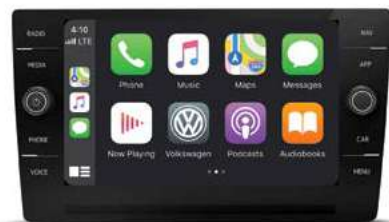
Apple CarPlay integration for your iPhone shown.

App-Connect allows you to connect your compatible smartphone with Apple CarPlay® (below), Android Auto™, or MirrorLink® to access select apps on the touchscreen display. From streaming music to mobile apps, it can be accessed on the touchscreen.