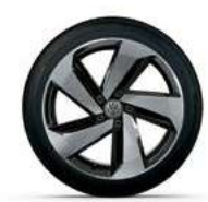
18" 5-spoke two-tone machined alloy