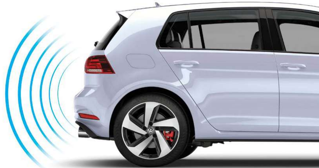
Rear Traffic Alert*